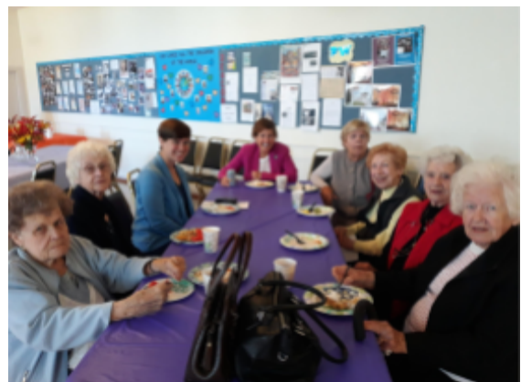
Sock-It-To-Me Sunday Potluck Lunch