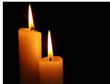
Light Two Candles

We too are on a journey, and we do not always know the way. But we chart our path by the star of peace. Even when violence and fear are raging and peace seems like a pipedream, we set our face steadily towards the light.