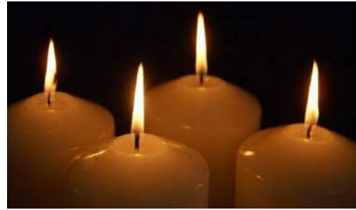
Light Four Candles

We too are on a journey, and we do not always know the way. But we chart our path by the star of love. Even when sharp words rattle in our ears, and our hearts sit cold and numb, we set our face steadily towards the light.