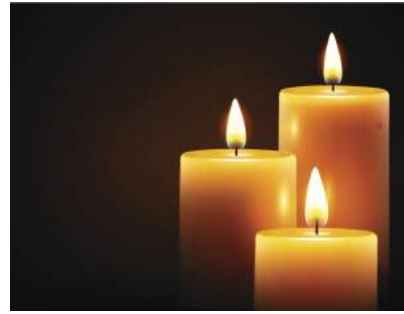
Light Three Candles

We too are on a journey, and we do not always know the way. But we chart our path by the star of joy. Even when despair is all around us and apathy seems the order of the day, we set our face steadily towards the light.