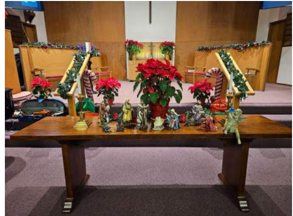
Christmas Eve Service, December 24, 2023